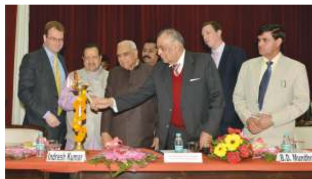
Dignitaries lighting the lamp at the Inauguration of the Conference