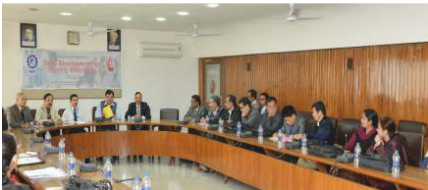
Technical Session on Sustainable Skill Development in progress in the Conference Hall of the Institute