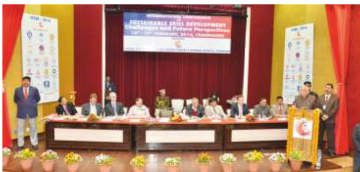
His Excellency Balramji Dass Tandon Hon'ble Governor of Chhattisgarh State delivering the Inaugural Address