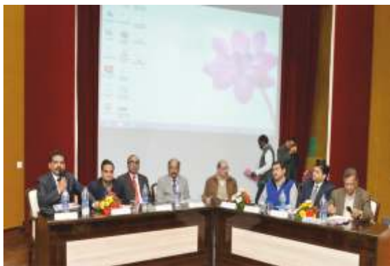
Plenary Session on Skill Development Strategies for Banking and Financial Services, Agriculture and Non-Farm Sector in progress