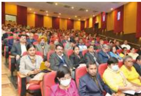
Technical Session on Sustainable Skill Development in progress in the Auditorium of the Institute