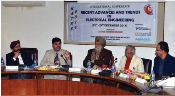
Dignitaries on the dias

The Electrical Engineering Department organized an International Conference on “Recent Advances and Trends in Electrical Engineering (RATEE-2014)” during December 23-24, 2014. 100 papers were received on the topics related to Control Applications, Power System, Power Electronics, Instrumentation, Soft Computing and recent trends in Electrical Engineering field. The review committee finalized 70 papers, which were published as proceedings.