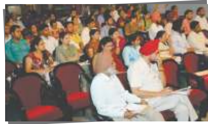
Participants of Induction Training Programme